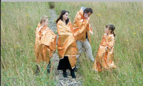
Family Pack - (Pack contains 2 x adult and 2 x child blankets)